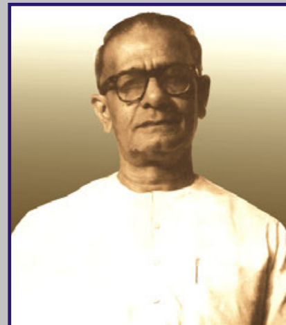
Prafulla Chandra Sen, Chief Minister of West Bengal (1962-1967) & President Board of Governors (1963-1990)