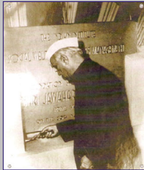
Pandit Jawaharlal Nehru laying the Foundation Stone of the Academic Block-1958